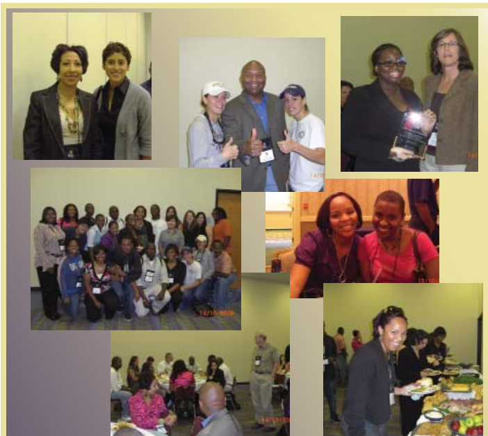
PHOTO BOOTH - CONFERENCE 2008

Plan to take a break and enjoy all that Atlanta has to offer. The Omni offers five-star services and there are many fine restaurants just a short walk from the hotel. Visit the Fernbank Museum of Natural History and take in an IMAX film or explore one of the exhibition galleries, stop by the High Museum of Art, the leading art museum in the southeast, take in an Atlanta Falcons game at the Georgia Dome, attend a play or concert at the beautiful, historic Fox Theatre, take a sip at the new World of Coca-Cola, explore a downtown landmark – the Atlanta Zoo, or stroll through numerous shops at Atlantic Station.